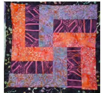
Back to Basics Strip Patchwork Friday 13 th January

'Big Baggy Bag' with Jean Turner WOW!! A big softie measuring approx 20" x 18". Single padded shoulder strap and a drawstring closure through either eyelets or buttonholes. Features 3 inside pockets and an optional "security bag" for your purse and keys. This is a really great bag for showcasing fabrics. Cutting out & some sewing to do before attending the class. Suitable for confident beginners upwards. Machine Sewn. All Day 10.00am - 4.00pm.