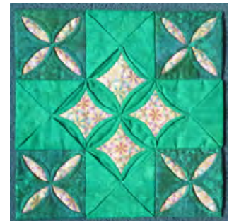
Cathedral Window/ Secret Garden Friday 16 th March