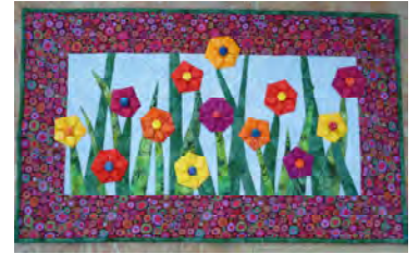
Garden for any Season Thursday 8 th March

Afternoon only 1.30pm - 4.30pm. Suitable for any level.