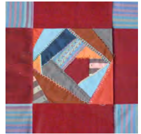
Crazy Patchwork Thursday 9 th February