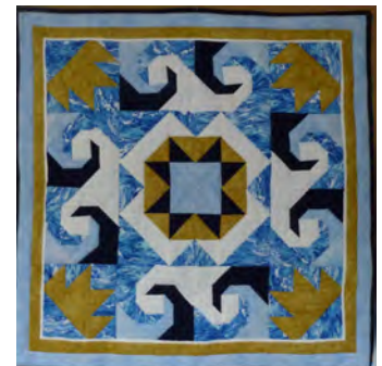
Star Trails Friday 20 th January