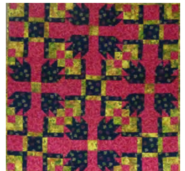
Paws for thought Thursday 2 nd February