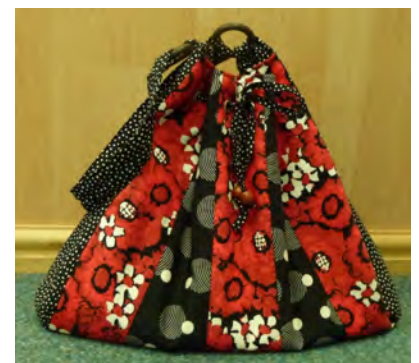
Big Baggy Bag Saturday 21 st January