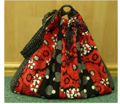
Big Baggy bag Monday 20 th February

'Big Baggy Bag' with Jean Turner WOW!! A big softie measuring approx 20" x 18". Single padded shoulder strap and a drawstring closure through either eyelets or buttonholes. Features 3 inside pockets and an optional "security bag" for your purse and keys. This is a really great bag for showcasing fabrics. Cutting out & some sewing to do before attending the class. Suitable for confident beginners upwards. Machine Sewn. All Day 10.00am - 4.00pm