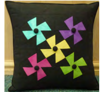
Windfarm Cushion Thursday 1 st March