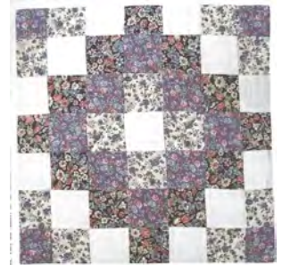
Back to Basics Squares Friday 10 th February