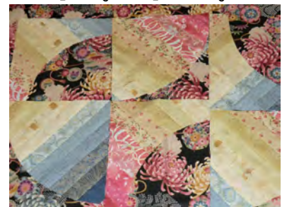
Strips 4 Saturday 11 th February