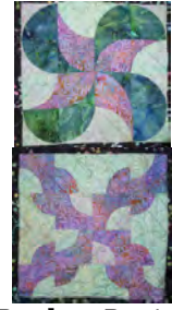
Back to Basics Curved Seam Friday 23 rd March