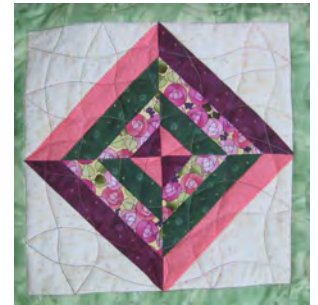
Back to Basics Stripped Patchwork Friday 9 th March