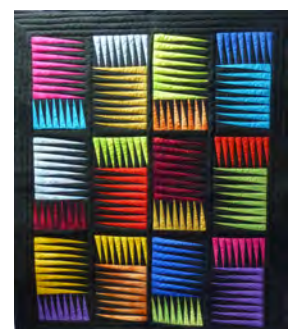
Rather Pointy Saturday 18 th February