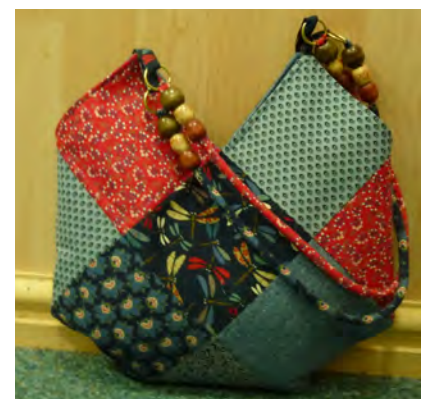
Square Dance Saturday 17 th March