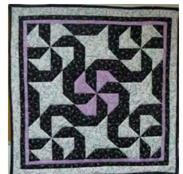
Ribbon Maze Friday 2 nd March