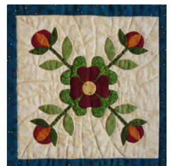
Rose of Sharon Friday 3 rd February