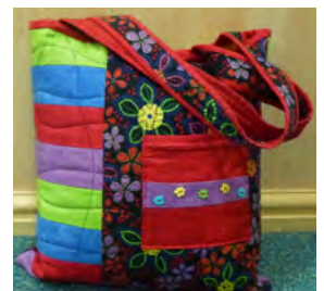
Stripes and Something Friday 17 th February